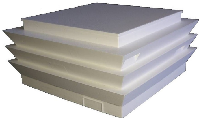
Model of Jwahmose Architecture